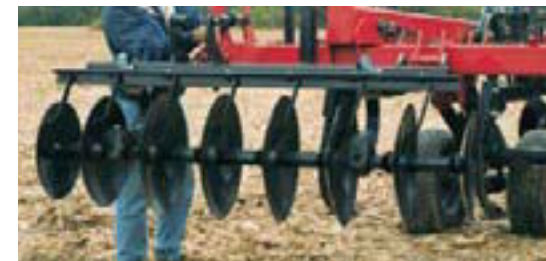
Fine-tune the MRX690 for your speed requirements and farming practice. The depth of front and rear gangs can be adjusted independently by turning mechanical ratchet-styled turnbuckle (shown). Hydraulic adjustment is also available.