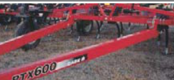
Floating hitch provides improved front-to-back land following capabilities.