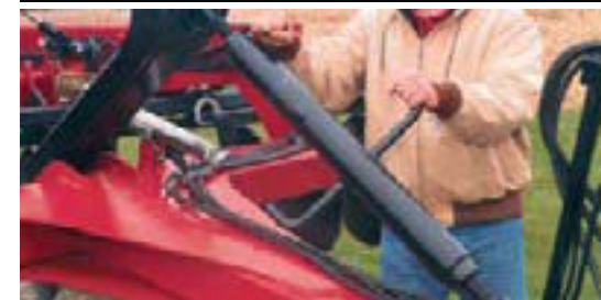
Level the MRX690 fore and aft with a twist of the turnbuckle, matching the hitch to the tractor's drawbar. No special wrench is required. This constant level hitch holds the frame level for an even and consistent depth throughout the entire working range of the implement.