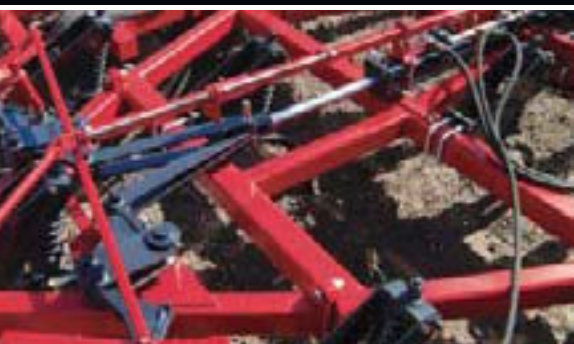
Single cylinder depth control means better reliability, more accuracy and easier maintenance.