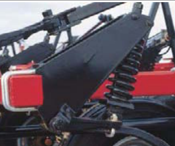
550 or 650 lb. (250 or 295 kg) trips are available to match field conditions.