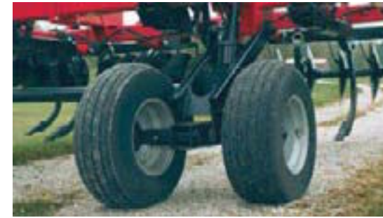
Walking-beam axles on the MRX690 enable it to float over wet or soft soil and provide a level ride over the roughest field conditions. The special non-centered pivot bearing in the walking beam carries less weight on the front tandem to carry through soft spots.

For additional operator safety and convenience, the MRX690 has a swivel hose stand . This stand allows the operator to swing the hydraulic hoses out of the way of the hitch while hooking up the implement. It also holds the hoses above the hitch area to prevent pinching during operation.