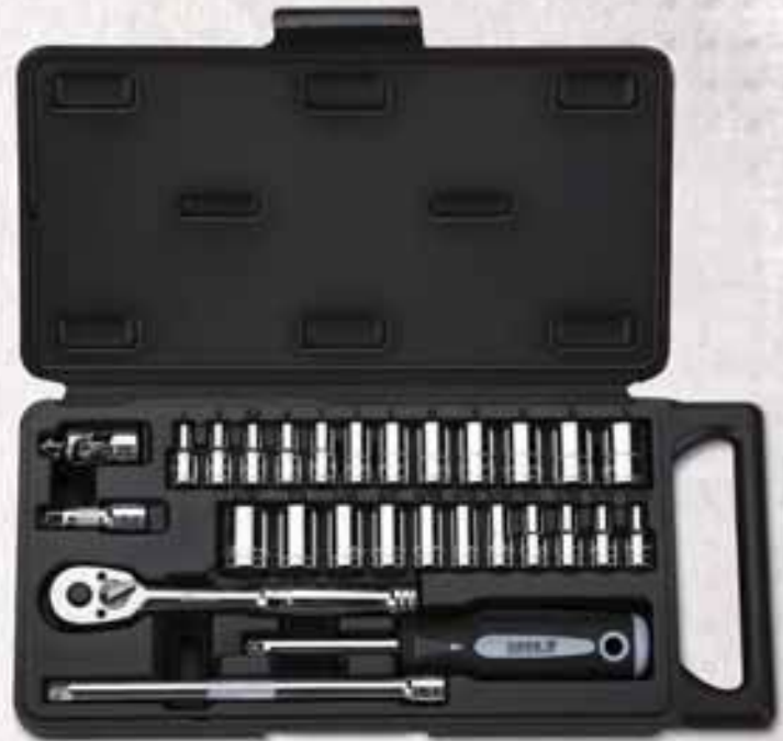
Part No. SC10001