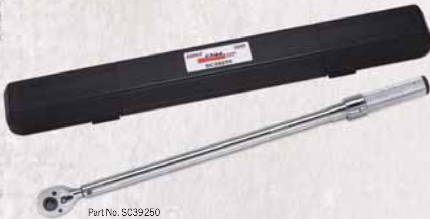
Part No. SC39250