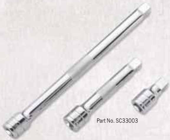
Part No. SC33003