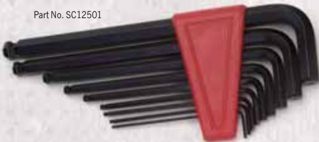
Part No. SC12501