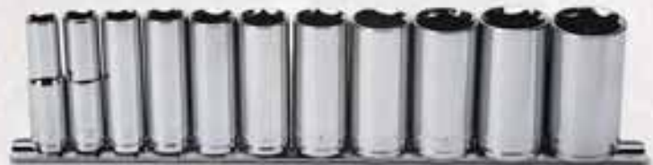
Part No. SC22001