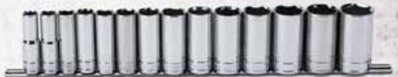
Part No. SC32501