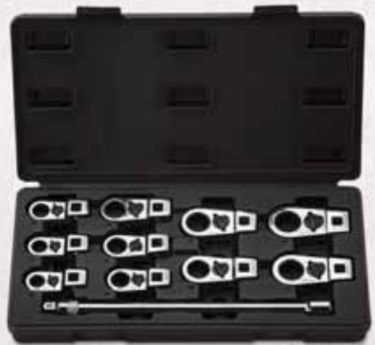
Part No. SC24501