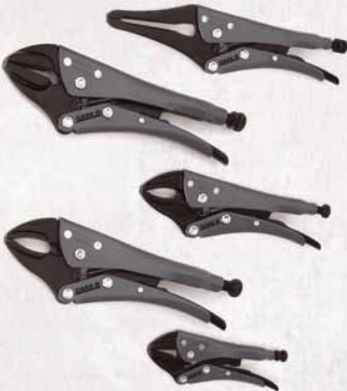
Part No. SC90005