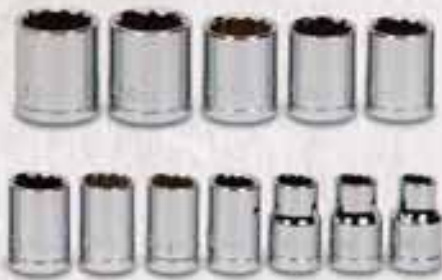
Part No. SC20501