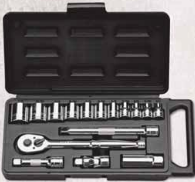
Part No. SC20001