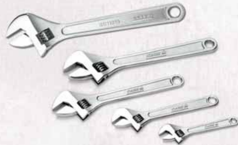
Part No. (From Top to Bottom) SC11015, SC11012, SC11010, SC11008, SC11006