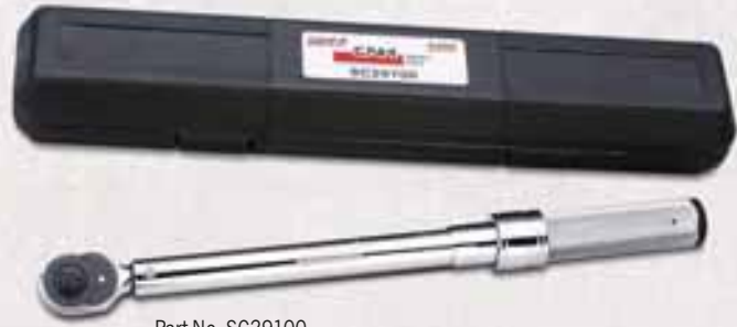
Part No. SC29100