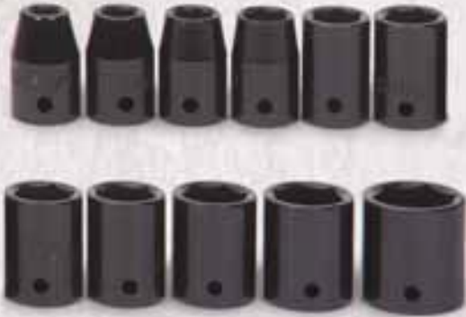
Part No. SC31001