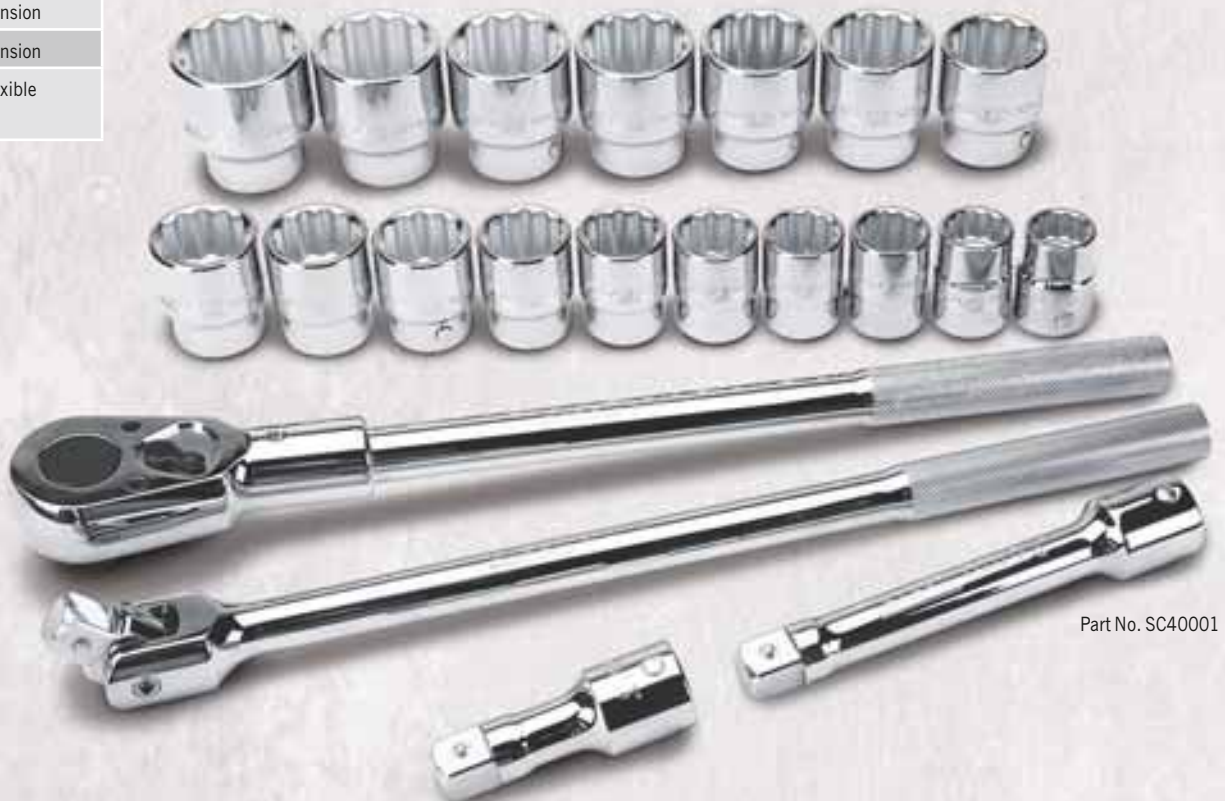
Part No. SC40001