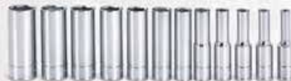
Part No. SC14501