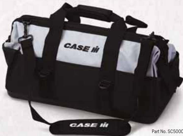
Part No. SC50001