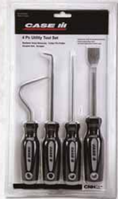
Part No. SC80520