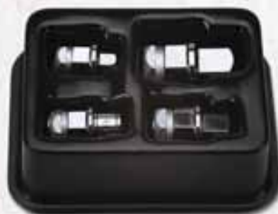
Part No. SC80550

“The highest reward for a person's toil is not what they get for it, but what they become by it.”