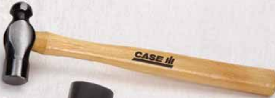
Part No. SC13016