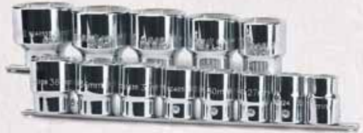
Part No. SC40501