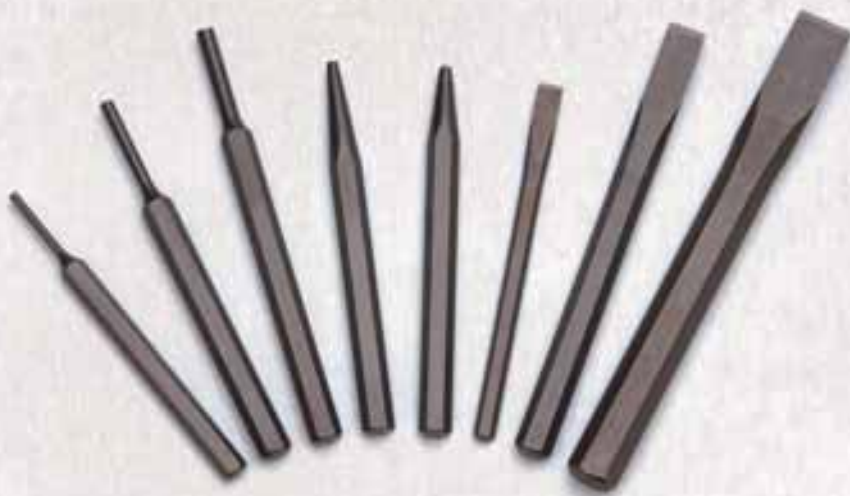
Part No. SC13100