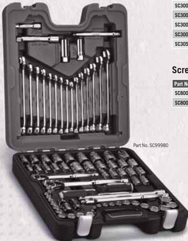
Part No. SC99980