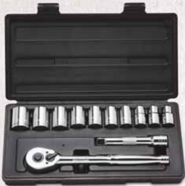
Part No. SC30001