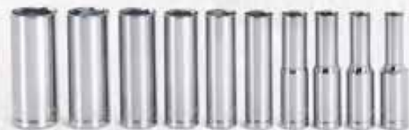
Part No. SC14001