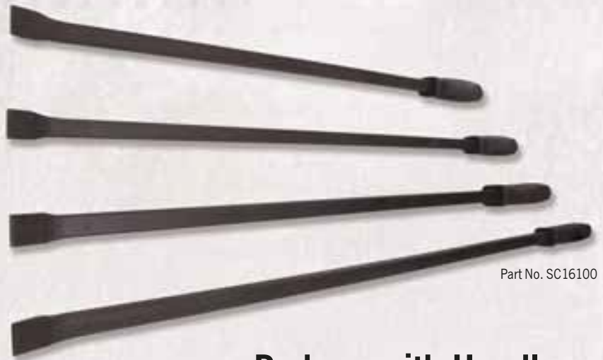
Part No. SC16100