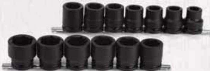
Part No. SC41001