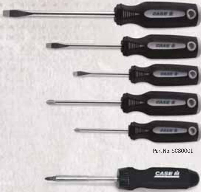
Part No. SC80001