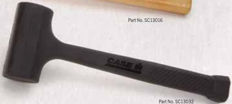
Part No. SC13032