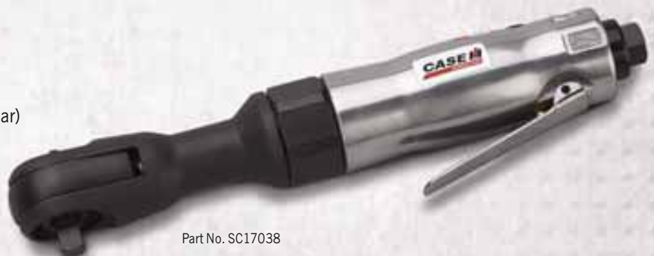
Part No. SC17038