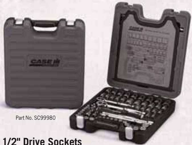
Part No. SC99980