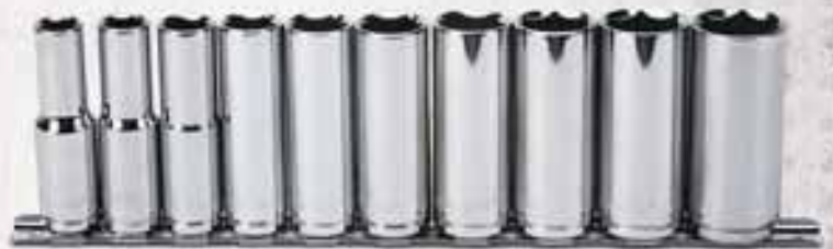
Part No. SC32001