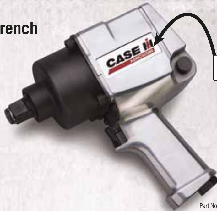
Part No. SC17075