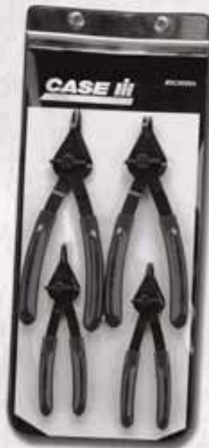
Part No. SC90004