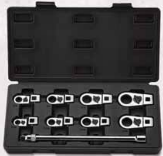
Part No. SC24001