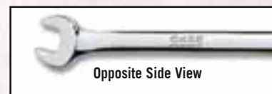
Opposite Side View