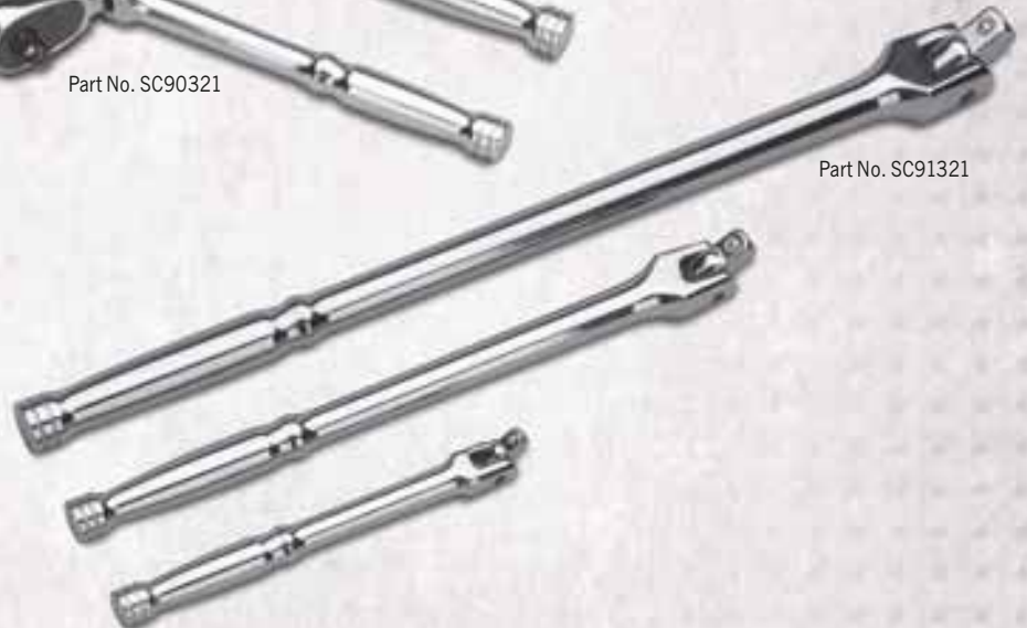
Part No. SC91321