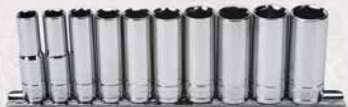
Part No. SC22501