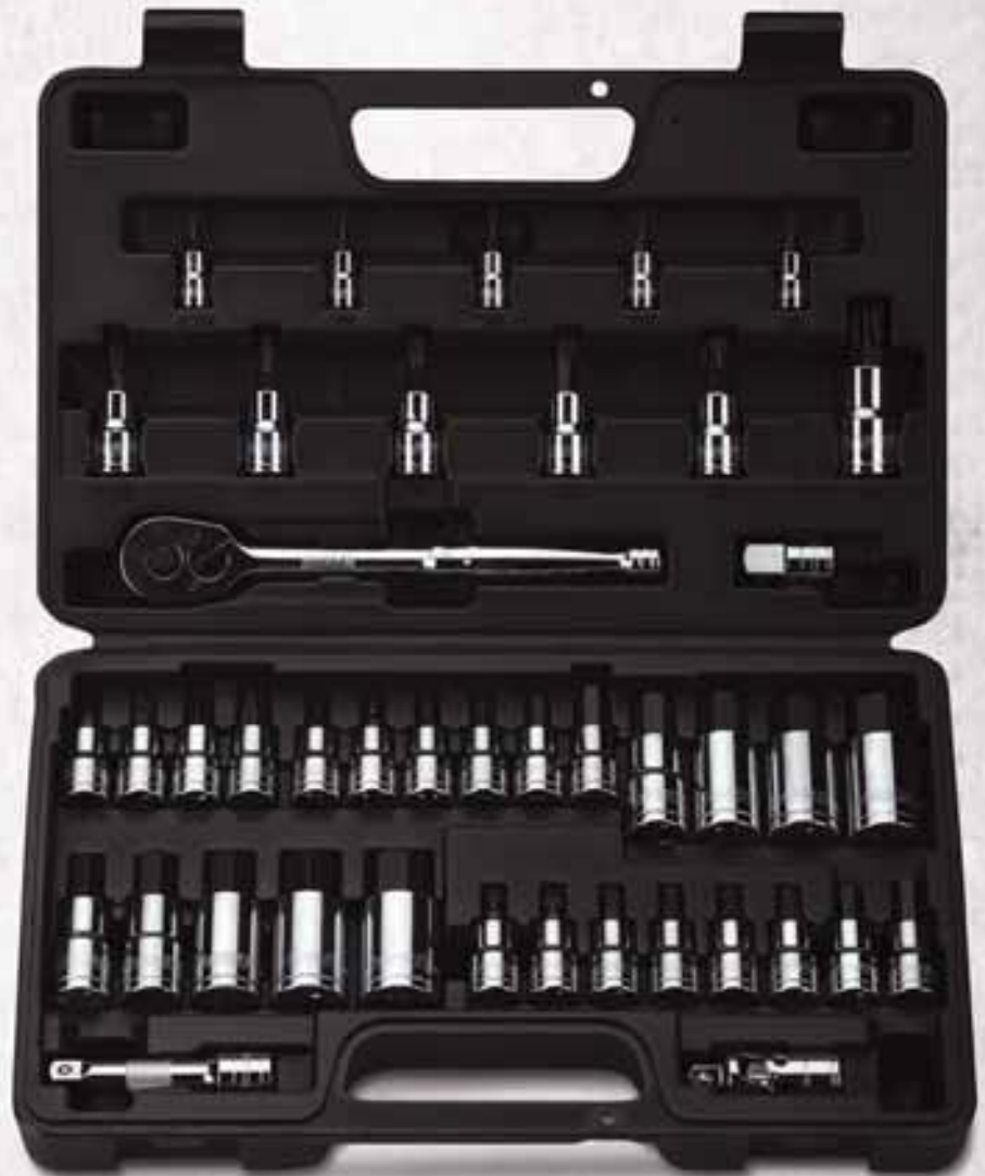
Part No. SC18001