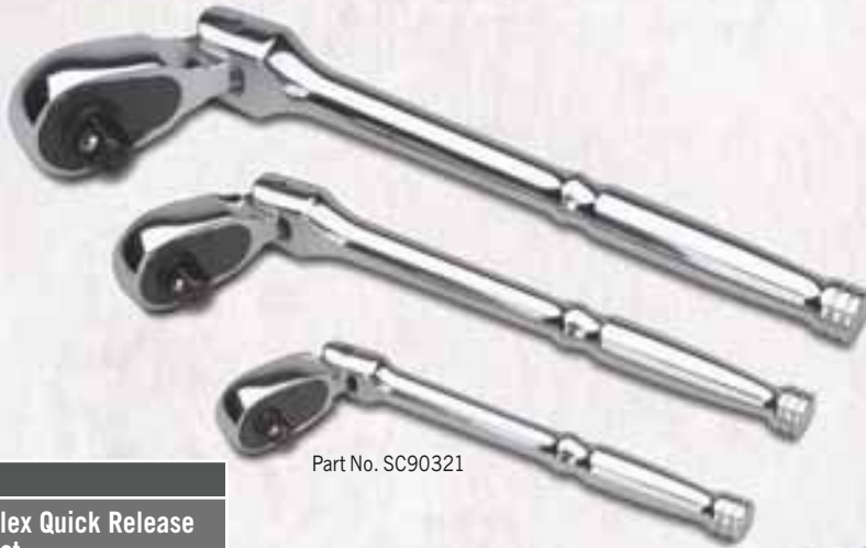
Part No. SC90321