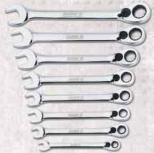
Part No. SC70001