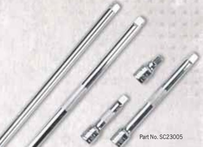
Part No. SC23005